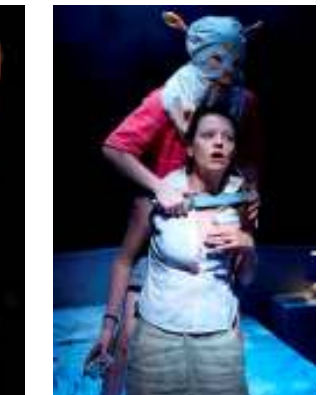
From left: The Visit (2005), Falling Petals (2006), The Laramie Project (2007), The Caucasian Chalk Circle (2008) and The Dark Room (2009).